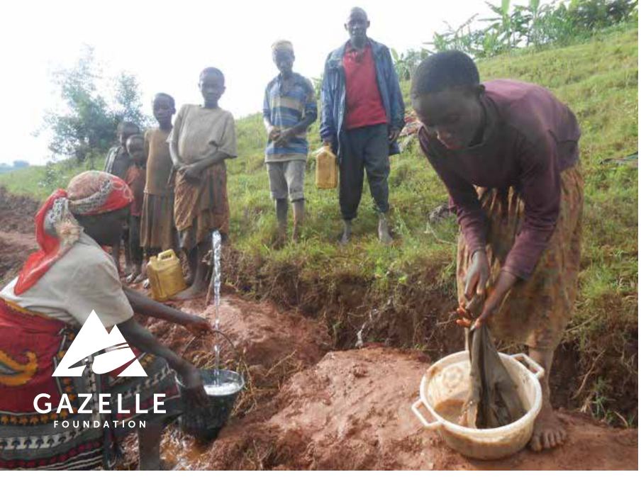
When contrast is an issue, please use the all-white logotype option and ensure sufficient contrast exist between the photo and the mark.